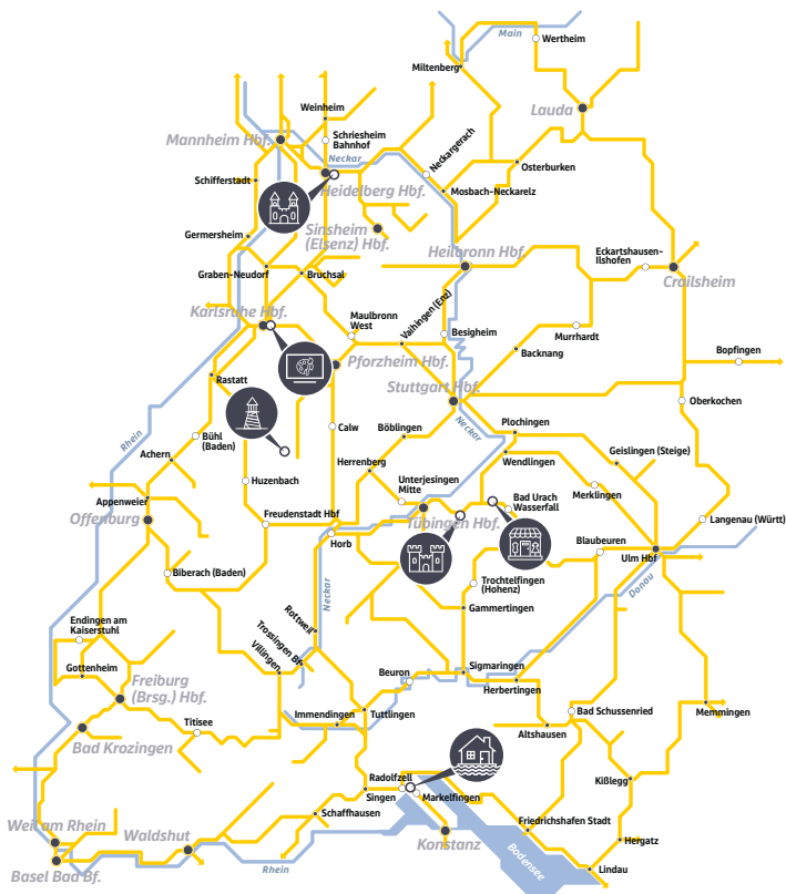
Schematic map of public railway lines and stations